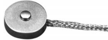
Model 13 Compression Only